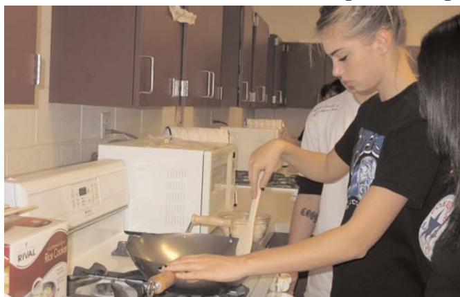
Study of ethnic foods