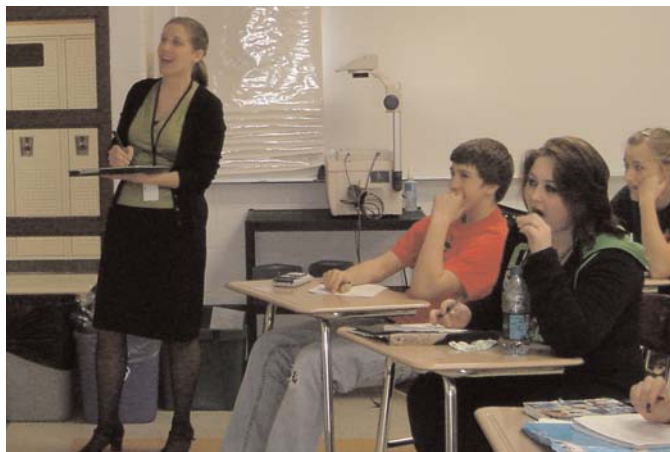
Wireless tablet technology

Second City Improv Educator-in-Residence in advanced acting class. VHHS - $6,400