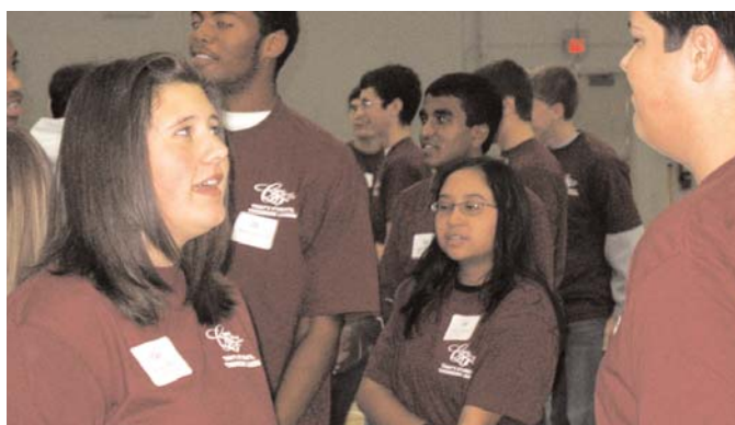
Student Leadership Conference