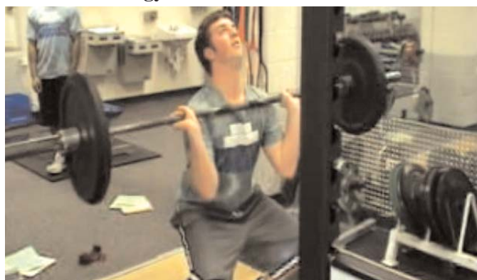
Advanced weight training lifting lab