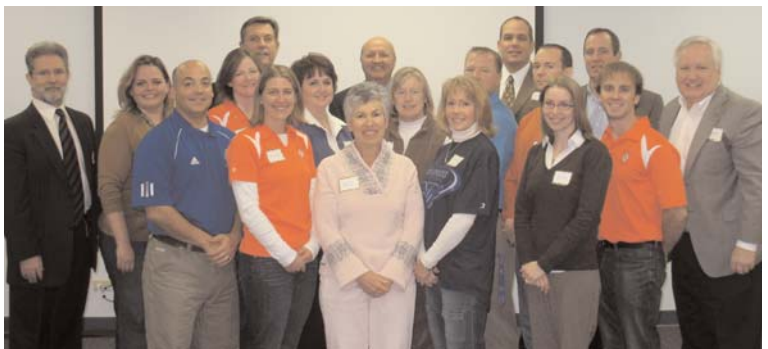
Fall 2008 Innovation Grant recipients are joined by the Foundation trustees for the grant presentations.