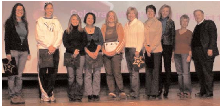
The first Innovation Grant recipients were honored in Spring 2008.