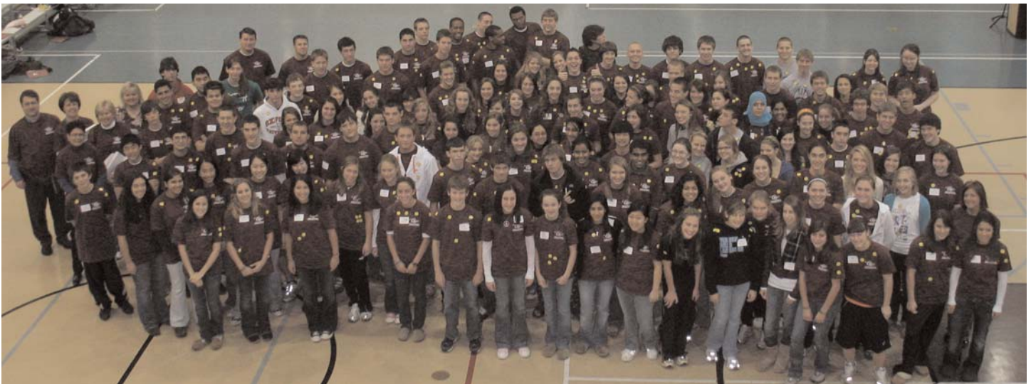
District 128 students and staff gather for a group photo during the November 2008 Student Leadership Conference. The keynote speaker for the conference was funded by the Foundation.